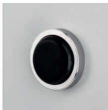
Stainless steel buffer Schäfer ES6015