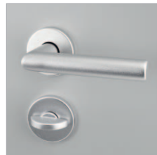
Aluminium door handle Schäfer AL7050