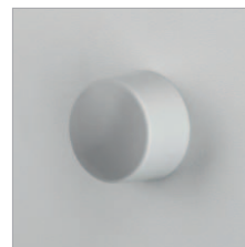
Nylon buffer Schäfer N8015