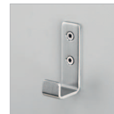
Stainless steel hook Schäfer ES6011