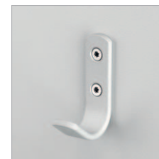
Aluminium hook Schäfer AL7011