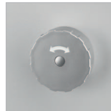
Nylon one hand door knob