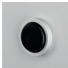
Aluminium buffer Schäfer AL7015