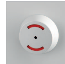
Aluminium one hand door knob INSAFE