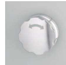
Stainless steel one hand door knob