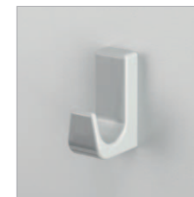
Nylon hook Schäfer N8010