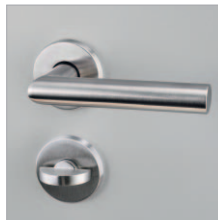
Stainless steel door handle Schäfer ES6050