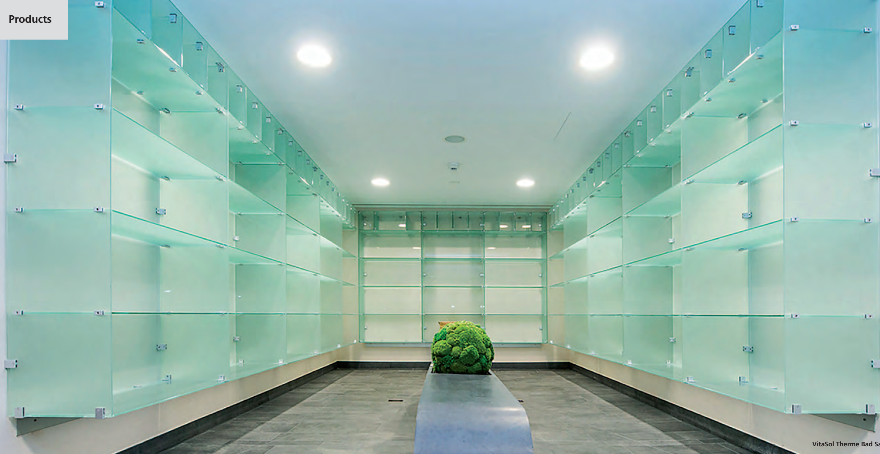
VitaSol Therme Bad Salzuflen

Store valuables stylishly and safely. Shelves, storage and valuables compartments.