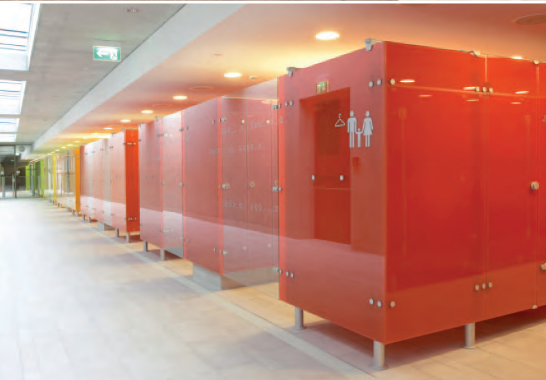
Changing rooms for swimming pools and spas.